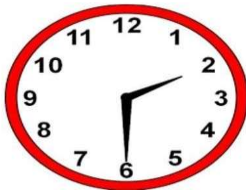
Il est deux heures et demie. ( Il est deux heures trente)