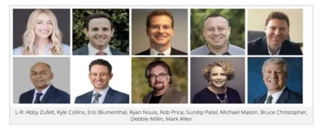
Below, 10 business executives share their best recruiting advice for small business owners.

• Thought Leadership Article: Thought Leadership articles are long-form pieces of content written by a subject matter expert. These articles are beneficial to both the publisher and the author.